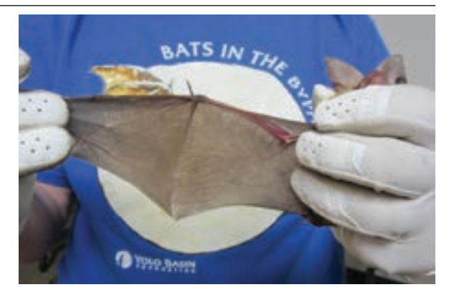
NorCalBats' Corky Quirk extends a Pallid Bat's wing

facts are that bats can be found on every continent but Antarctica. They are born as a single birth, but there are rare occasions when they have a twin. Bat guano (droppings) is highly valued and used in fertilizers. A bat's wings are made of skin with trails of blood vessels